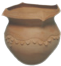
Legend of Mashpee Pond