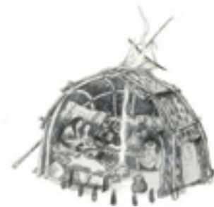
Wôpanâak Language Reclamation